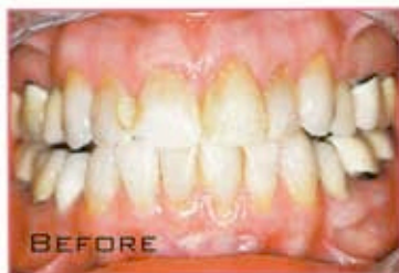
BELOW: Amazing before & after shots of ACCD's outstanding work.