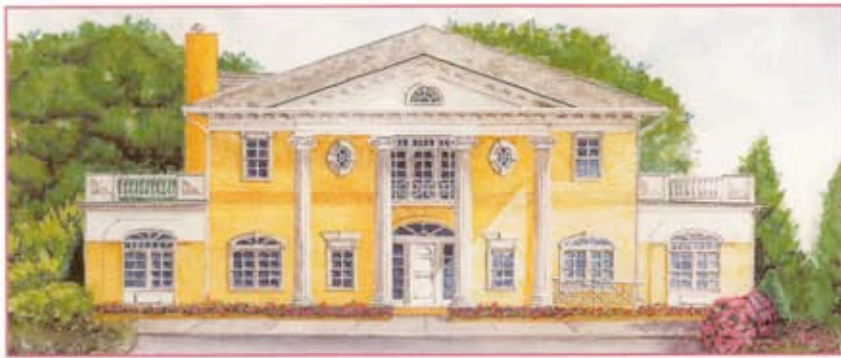
ABOVE: An illustration of the new office location coming Fall 2002 located at 4840 Roswell Road.

Considering a new smile? Well, go ahead and direct your steps to the Atlanta Center for Cosmetic Dentistry. Receive not only a beautiful smile, but also the best in quality, professional treatment, spa amenities and an ambiance not to be forgotten.